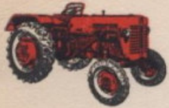
FARMALL- DIESELSCHLEPPER 12-14-17-20-24-30 UND 50 PS RAUPENSCHLEPPER