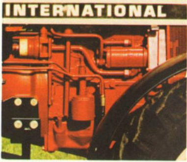
Four cylinder International D-206 diesel engine designed for unequalled economy and performance