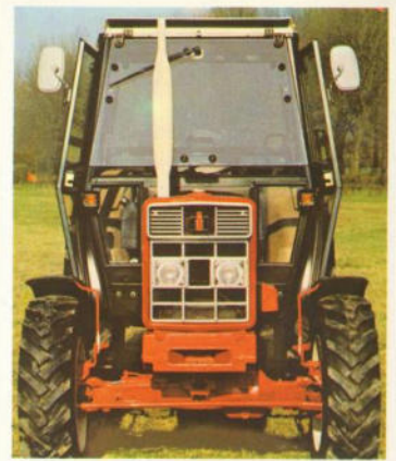
Big, front-opening swing doors can be secured ajar to admit fresh air

The 733 is equipped with the proven direct-injection D-206, 4-cylinder diesel engine delivering 48,5 kW (66 hp) at 2180 rev/min. Tested under the severest climatic conditions and proven a thousandfold in other International machines. The governed engine ensures long life, high torque, and abundant power reserve for heavy schedules. To suit your specific need three choices of transmissions are available: 8+4, eight forward, four reverse speeds; 16+8 with speed reducer; 16+8 with super creep speed. All transmissions are fitted with a double clutch which enables you to engage or disengage the P.T.O. on-the-go, and under load.