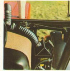
Ideal heating and ventilation system