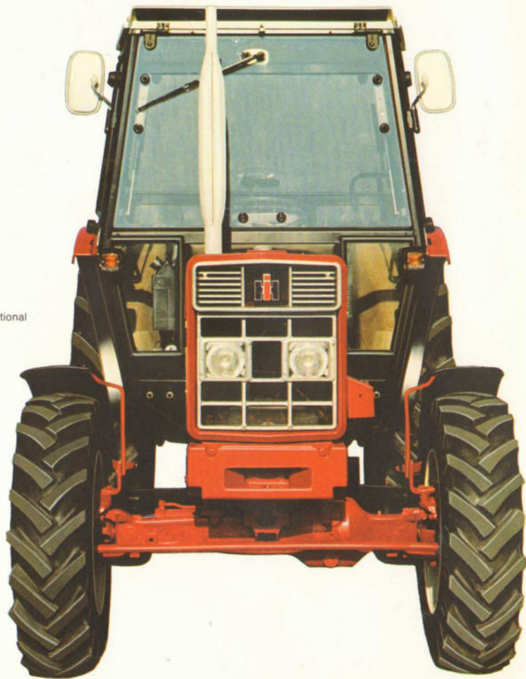
Cab and front splash shields are optional

Three-point hitch cat. II. Exact hydraulic draft and control system is today's most accurate control system. Upper link sensing responds to load changes automatically. Once set by means of a simple one-lever control, you have precise depth regardless of soil conditions.